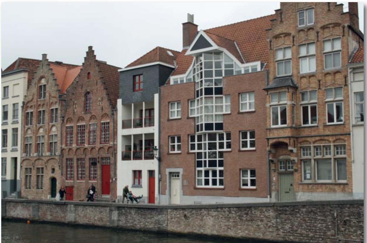
Housing project, Spiegelrei 8 and 9, 1985

While “postmodernism” breaks through internationally, Bruges holds on to the approach adopted in the 1970s. The influence of postmodernism is only visible in stereotypical structures and details: gables, arches, bays, dormers, balconies. Today this gives a very outdated impression. After 1990 international ‘abstract modernism’ gradually gains influence and slowly makes its way to the Bruges townscape. A subtle harmonisation with or interpretation of the typology, volume and texture of the surrounding area results in a number of innovative realisations. A growing difference of opinion about future constructions sets advocates of contemporary architecture against supporters of reconstruction (façadism) and historicising architecture.