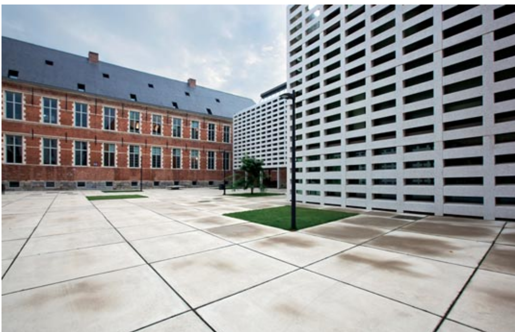
College of Europe, Verviersdijk 16, 2007