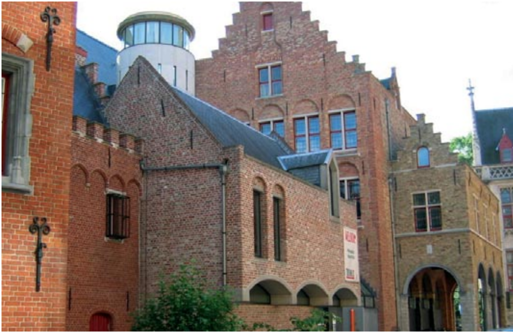
Former youth library, Spanjaardstraat, 1972