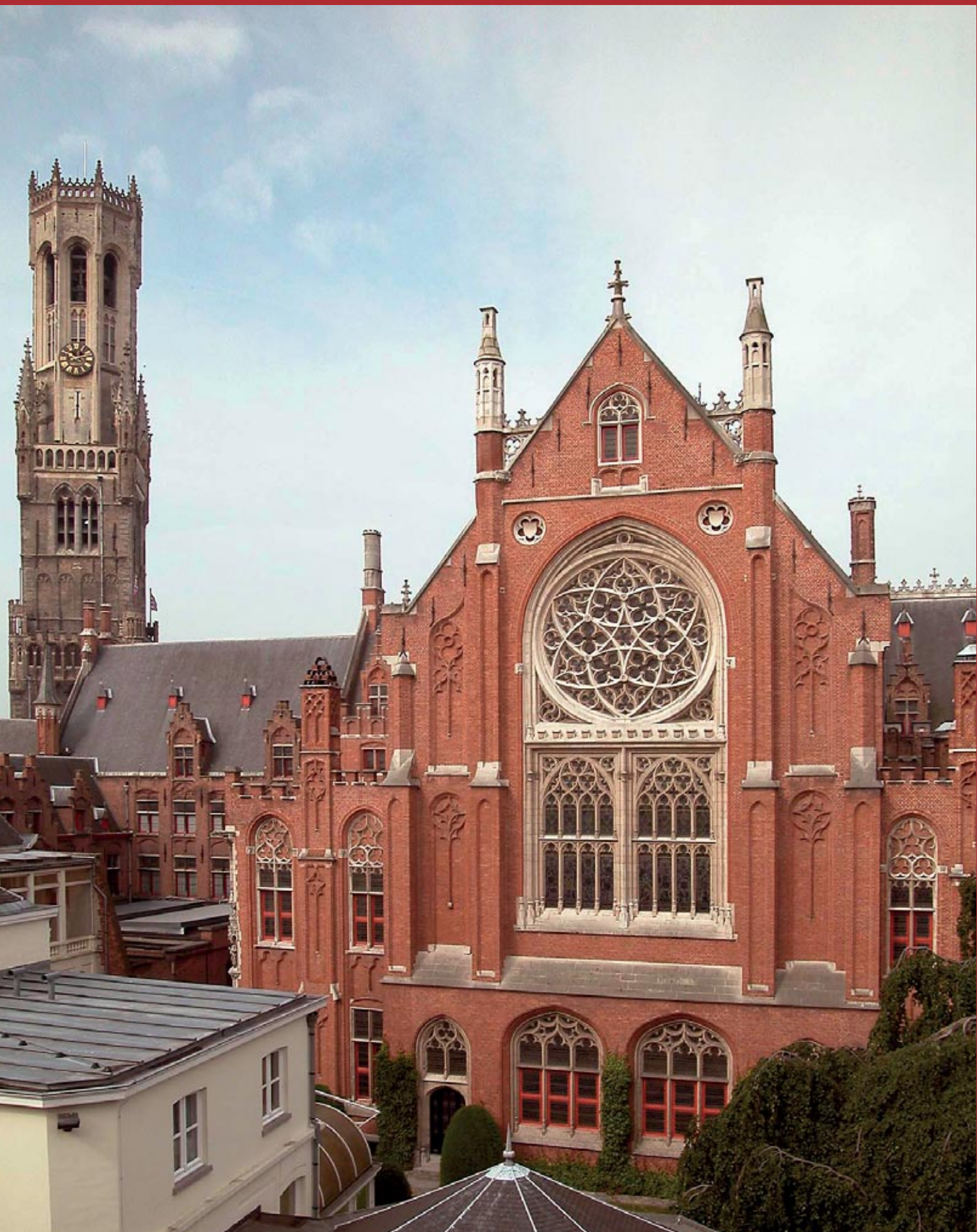
Gothic versus Gothic revival