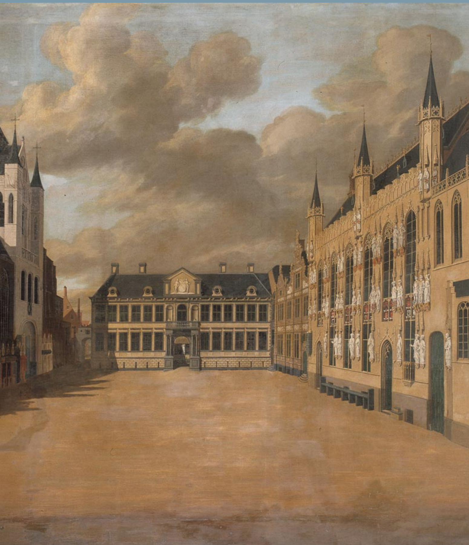
The 'Burg' in Bruges, Pierre François Ledoux, 1751