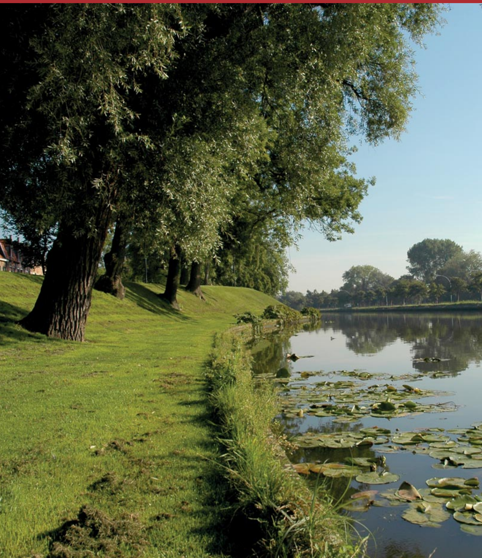
The Ramparts along the Ringvaart