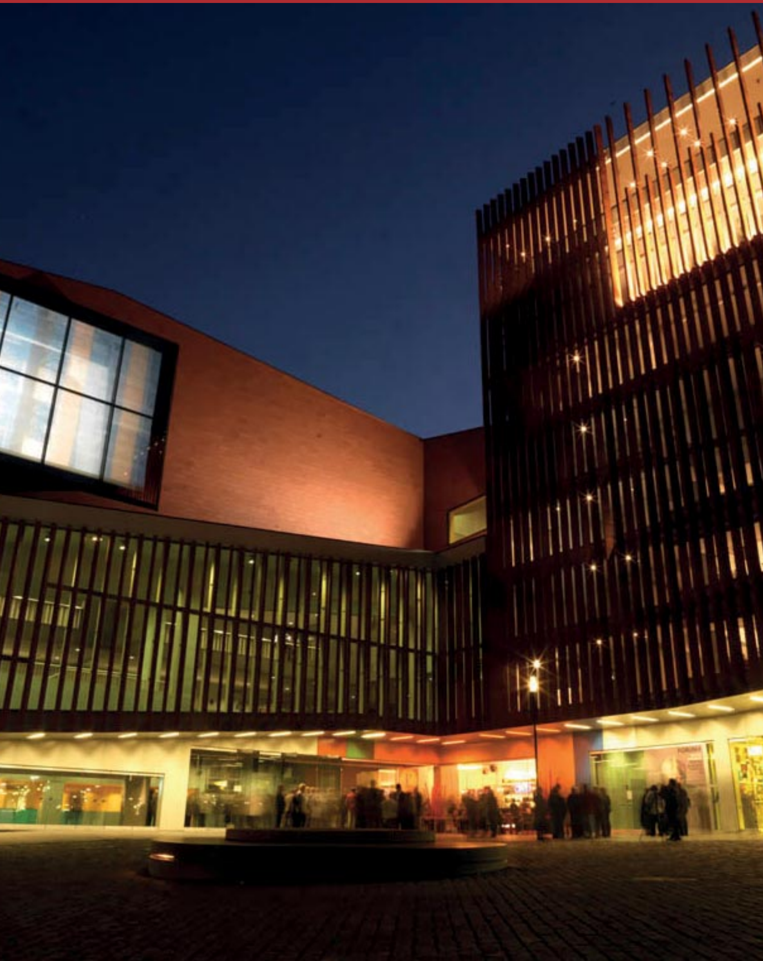
Concert Hall, 't Zand 34, 2002