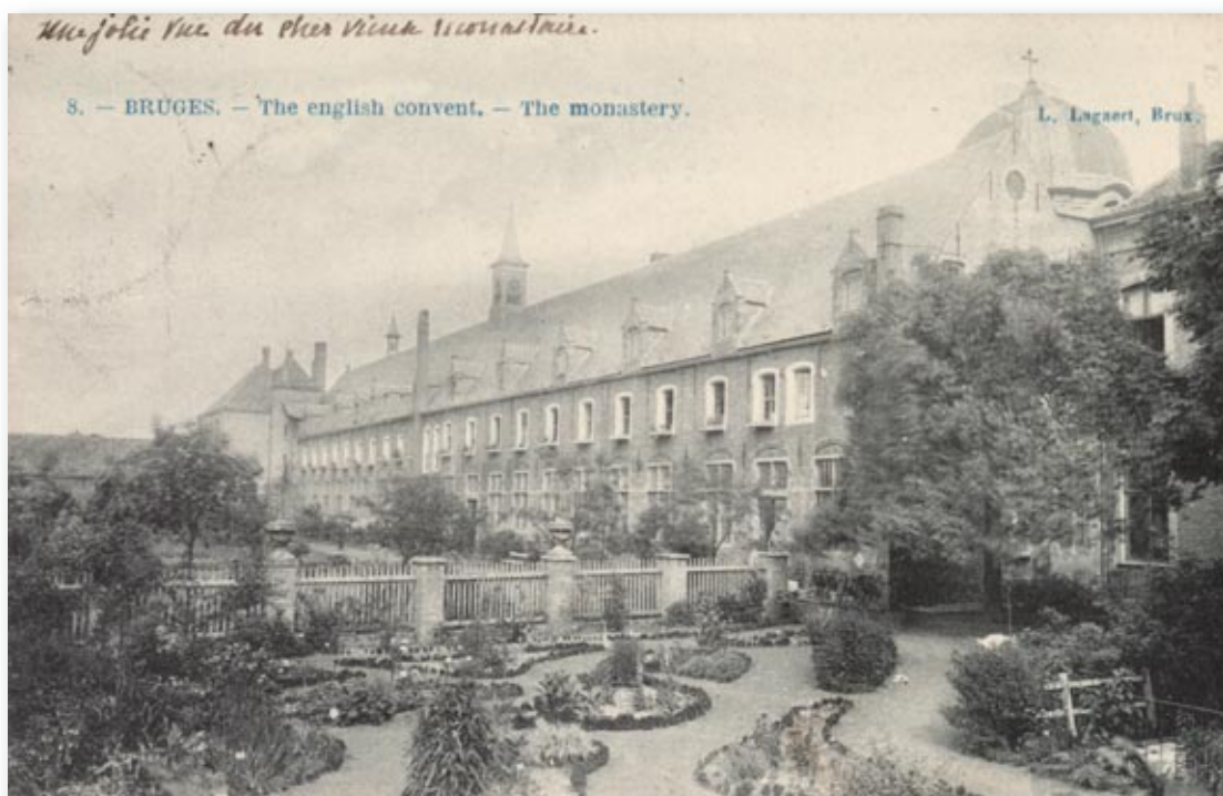
English convent, postcard, ca 1900

The sudden death of Mary of Burgundy in 1482 and the uprising against her husband, Maximilian of Austria, starts the decline of the city's prosperity. Together with the Burgundian court and the international merchants, local wealth disappeared from the city. Starting from 1520, the city also lost its direct access to the sea, causing international trade to move to the port of Antwerp. However, Bruges remained important as a regional centre with some international commercial contacts and a flourishing art sector.