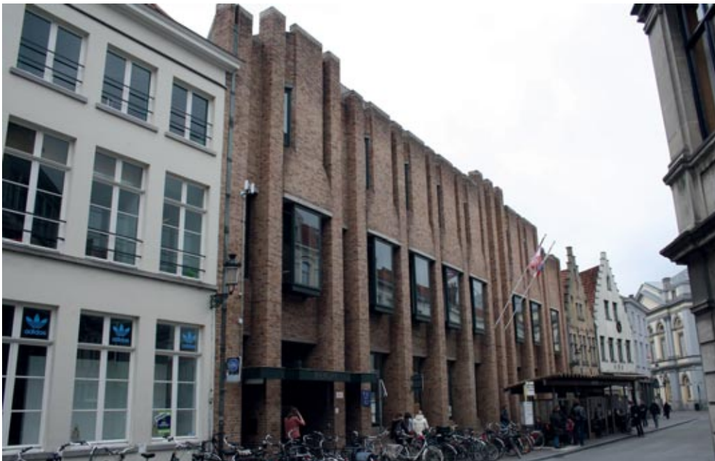
Public Library Bruges Kuipersstraat, 1975