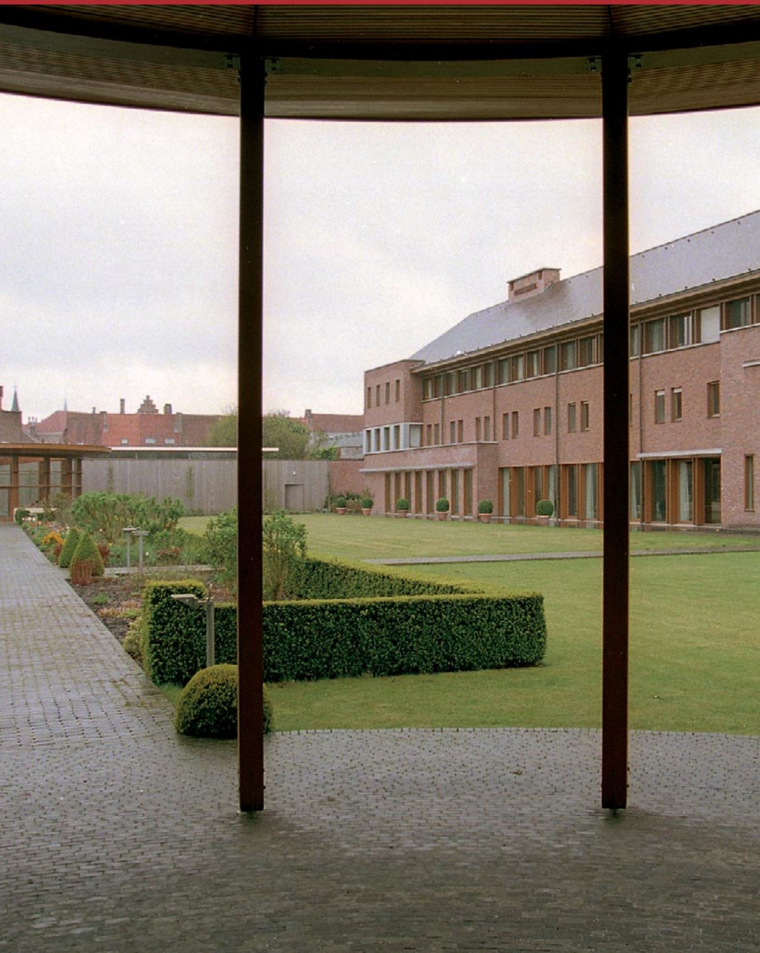
Covent of Dominican Sisters, Vlamingdam 34, 1992-1995.