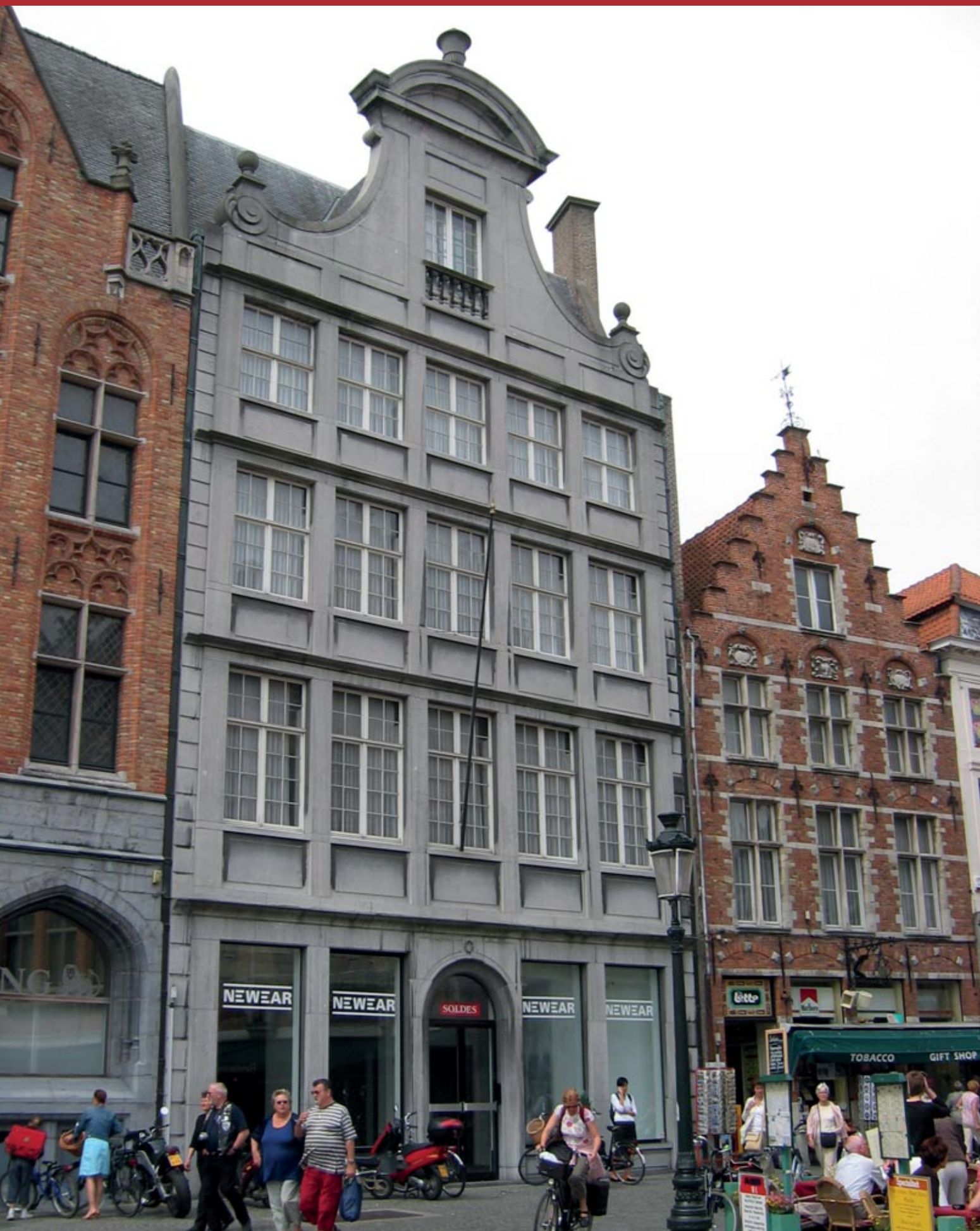
Former bankbuilding, Markt 20, 1971