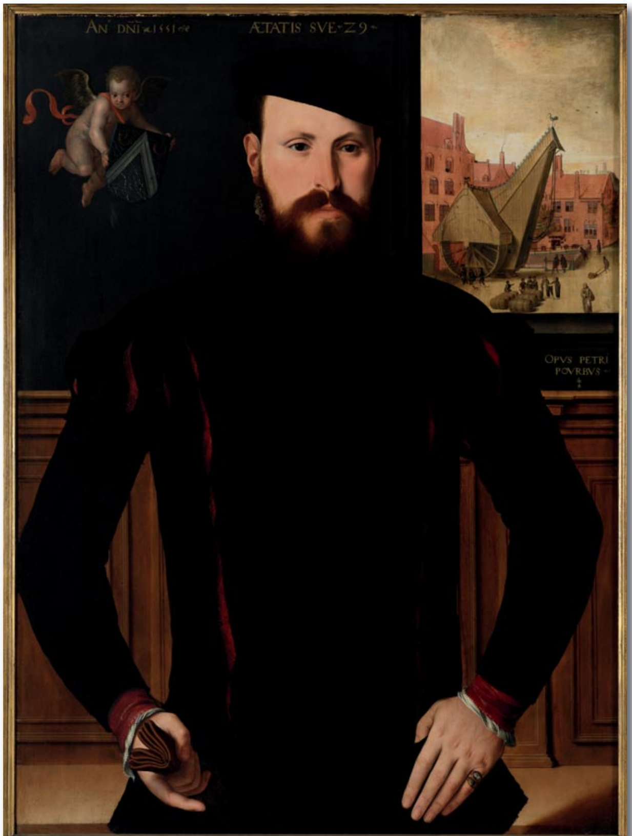
Portrait of Jan van Eyck , Pieter Pourbus, 1551

The city's unique universal value is also inextricably linked to the masterpieces of panel painting. Bruges is considered to be the place of birth of the Flemish Primitives. The central figures of this school of painting are Jan van Eyck and Hans Memling, who came to live and work in Bruges in the 15th century. Many paintings by these masters, but also by other contemporary and later artists from Bruges, were exported to other countries and undeniably influenced painting in the rest of Europe. The collection preserved in Bruges is impressive in its authenticity, its size and its quality.