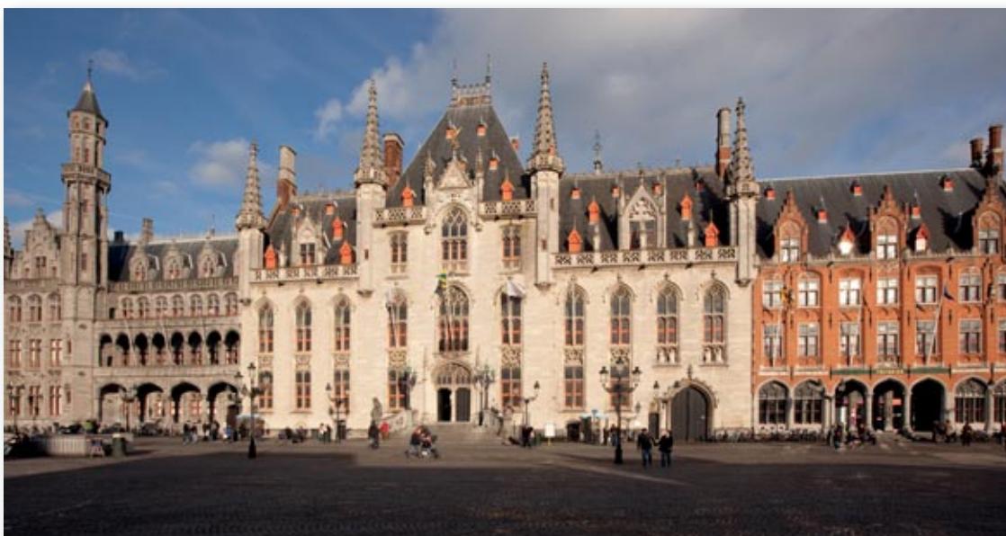
Neo-gothic ensemble, Markt

The exceptional universal value of the city of Bruges mainly lies in two key concepts: 'Authenticity' and 'Integrity'.