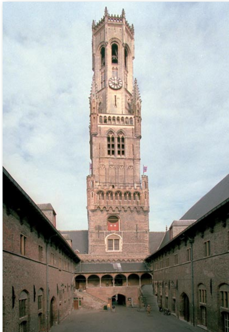
The belfry as seen from courtyard

The exceptional universal value of the belfries was recognised by Unesco in 1999, when 32 Belgian belfries were included in the World Heritage list. In 2005 the list was extended with the belfry of Gembloux and 23 belfries from Northern France.