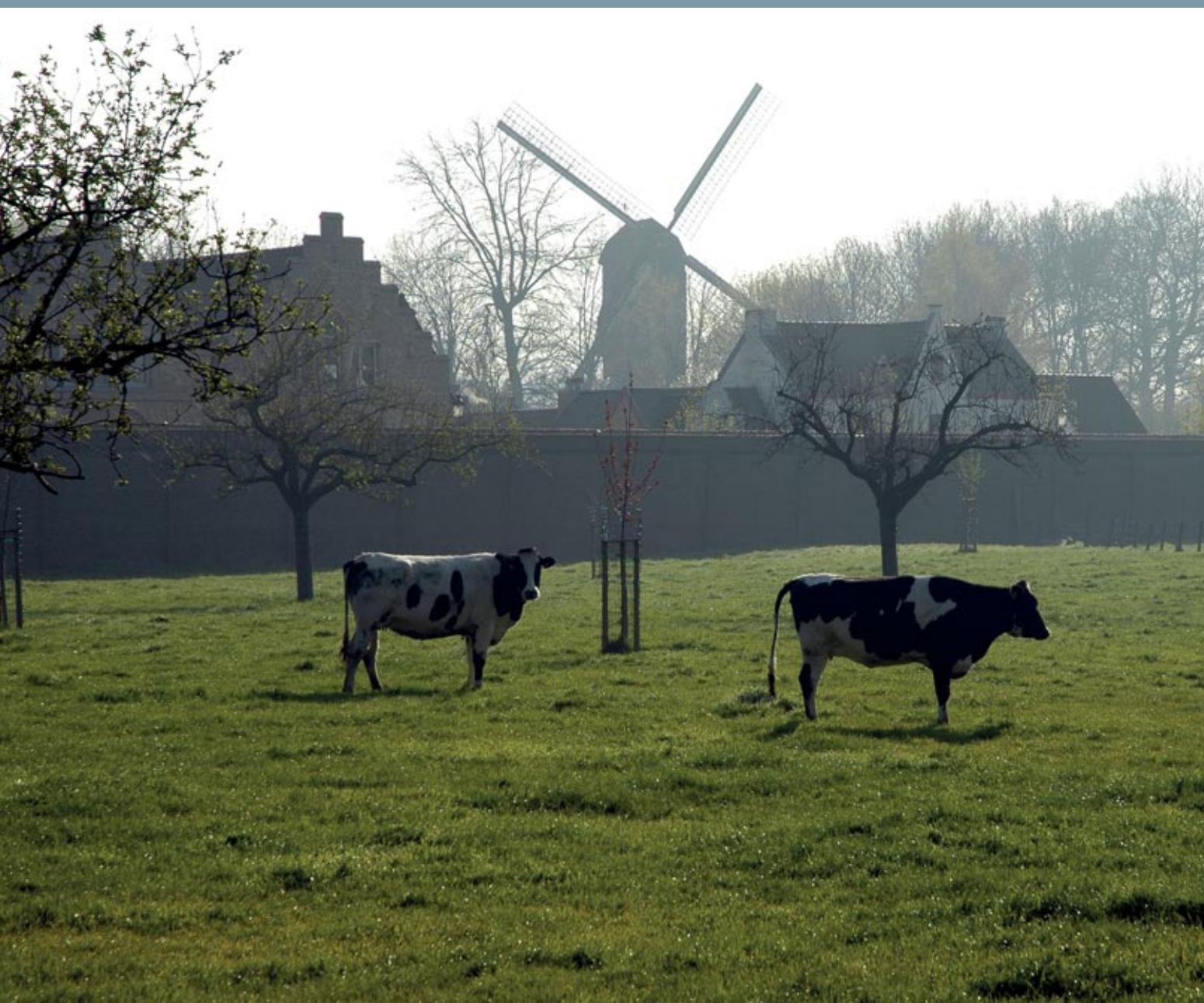
Garden of the Seminary, Potterierei