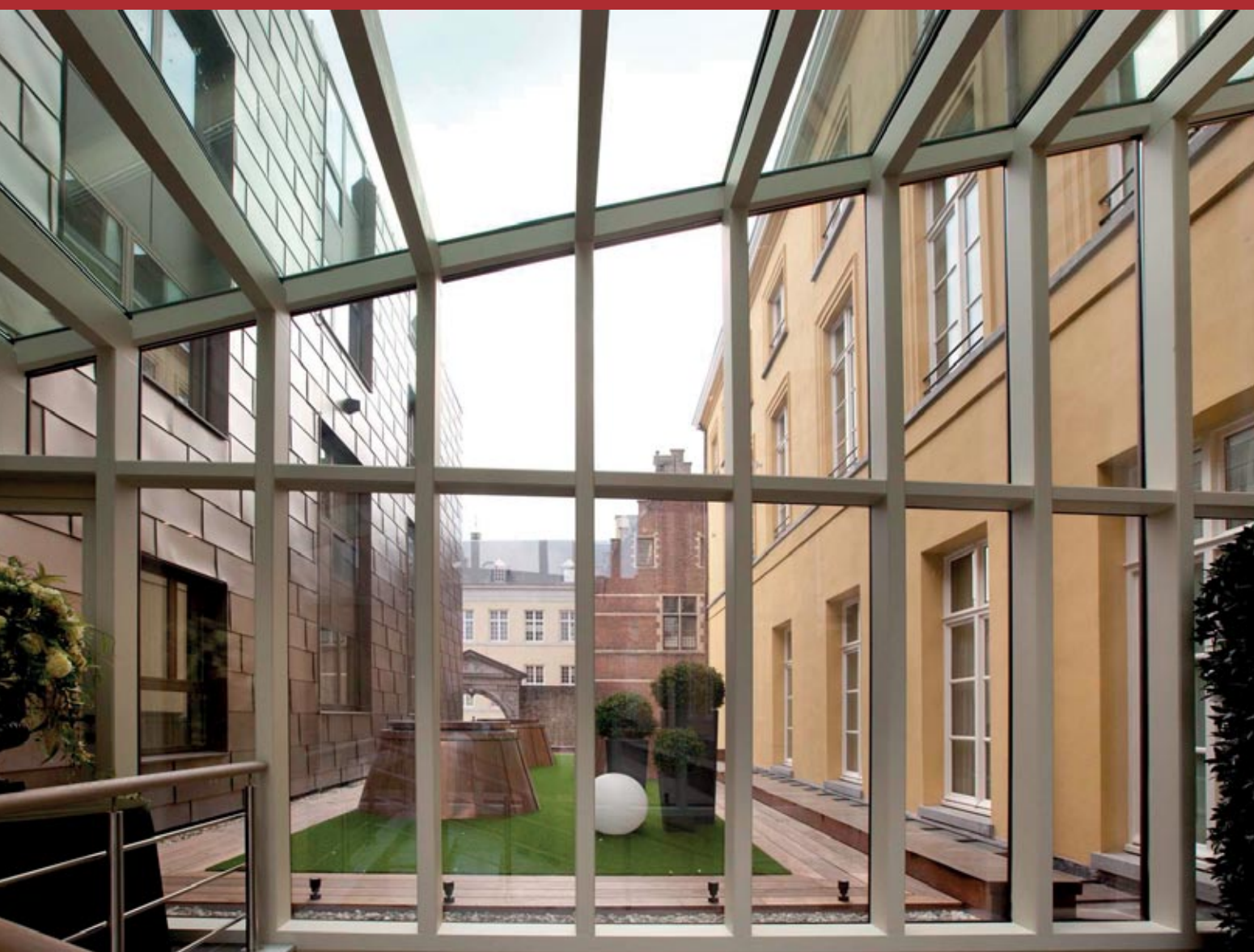
Grand Hotel Casselbergh, Hoogstraat 6 and 8, 2010