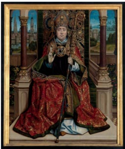
Altarpiece of Saint Nicholas with panorama view of Bruges, Master of the Legend of Saint Lucia, 15th century

The 14th century, a period of crises, revolts, epidemics, political unrest and wars in Flanders, ended with the merger of the dynasties of Flanders and Burgundy. The year 1384 was the start of the Burgundian era for Bruges. The city remained the most important international commercial centre north of the Alps for another century. Cloth production was gradually replaced by luxury goods, services in the banking sector and artistic crafts. The Burgundian court guaranteed a high local purchasing power, further increased by many foreign merchants who had international contacts from Portugal to Poland. Prosperity increased and travellers were impressed by the wealth and luxury reflected in the townscape. Art and culture reached an unprecedented climax in that period and a number of major projects were realised, which clearly shaped the city's fame. Bruges became the centre of oil painting, a technique practiced by the so called Flemish Primitives. The main representatives of this school were Jan van Eyck and Hans Memling, who both settled themselves in Bruges in the 15th century.