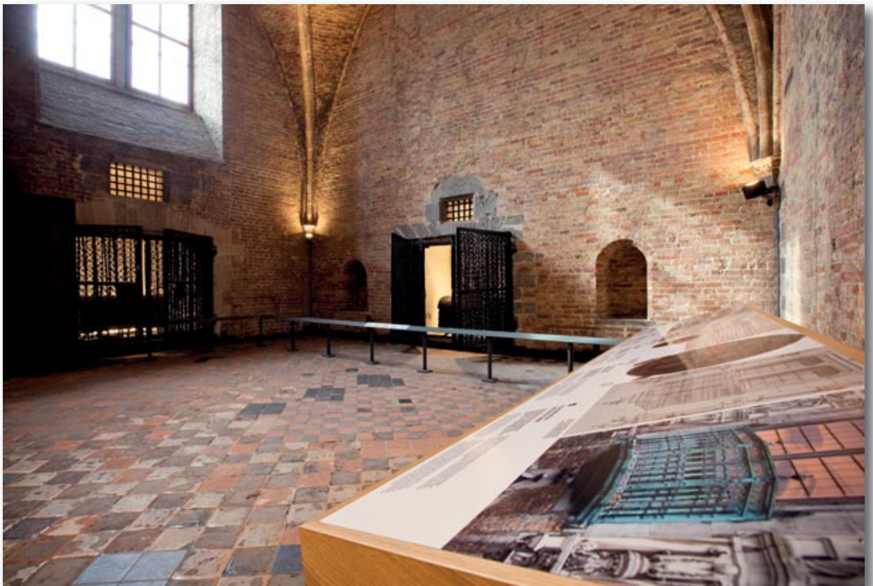
The treasury of the belfry, Markt

B elfries are the oldest witnesses of medieval civil public architecture. The highest concentrations can be found in Flanders, the Walloon provinces and the North of France, an area that developed into one of the most prosperous and urbanised areas to the north of the Alps from the 12th century onwards. Belfries were symbols of civil emancipation and the power of the cities. The belfry was not only the place where the urban privileges and regulations were kept, but also served as a means of communication with the citizens via the town crier or the ringing of bells. The tower was also used as an observation post for spotting danger within (fire) and outside (attacks) the city.