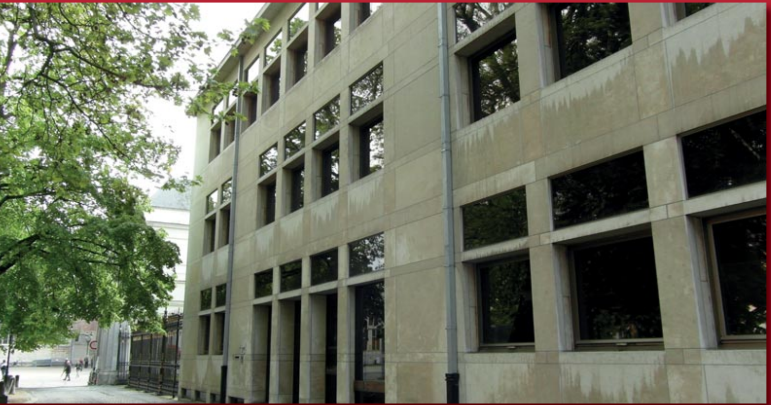
Provincial Government buildings, Burg 4 and 5, 1966