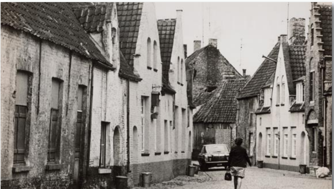
The Rolweg in 1964