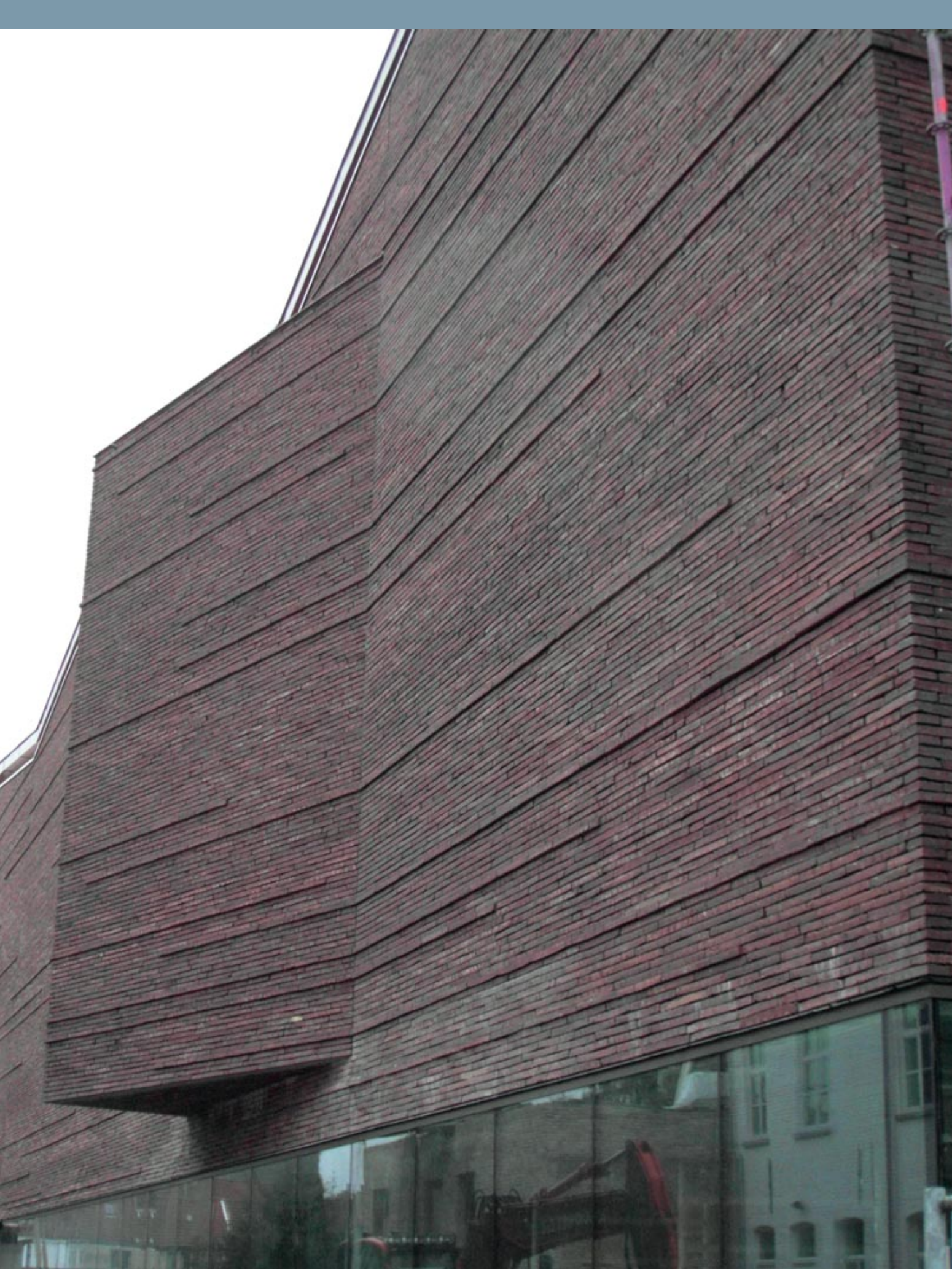
Public Records Office, Predikherenrei 4, 2012