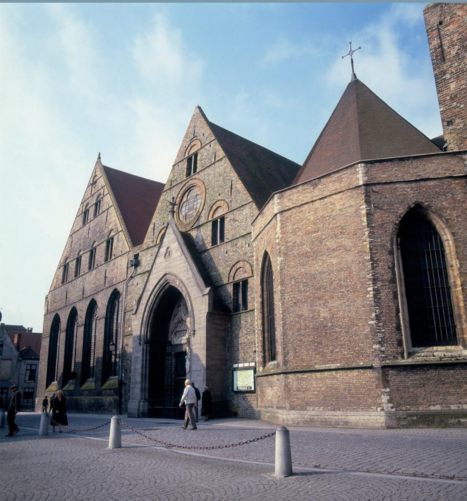
Former Saint-John's hospital, Mariastadt