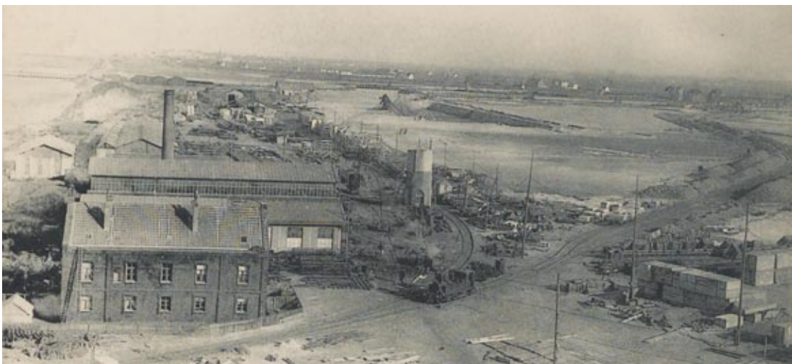
Construction of the port of Seabruges, 1901

Bruges intends to play an economically more important role in the future as well. New plans to re-establish a permanent connection with the sea through the construction of a new port take shape. Bruges has the support of King Leopold II (1865-1909) for this endeavour. The works start under his rule and the port of Seabruges can be officially inaugurated in 1907. However, all hopes for a revival of the old Bruges are thwarted by the two World Wars. Fortunately the city centre is largely spared from destruction.