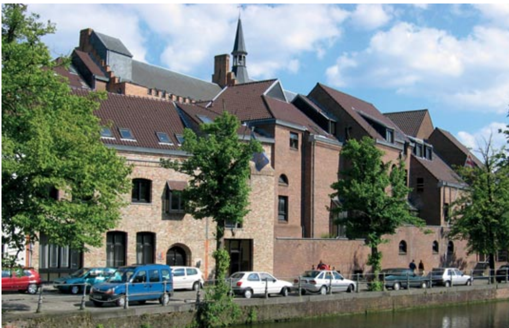
Collegebuildings, Potterierei 11-14, 1976