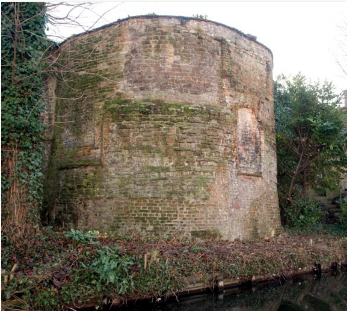
Remains of the first city walls from the 12th century, Pottenmakersrei

In the period from the 10th to the 14th century Bruges evolved into an important international trading town. A number of residential and commercial nuclei developed around the Burg in the 10th and 11th centuries. In the early 12th century the first city walls were constructed, surrounding an area of approximately 75 hectares. The buildings constructed in this period had a major impact on the topographic landscape of Bruges. It largely followed the course of the existing rivers. City gates were built on the main access roads. Remnants of one of the towers of the city wall have been preserved at Pottenmakersrei. During this period Bruges evolved into a commercial centre of European importance thanks to its central location at the North Sea and along the major trade routes.