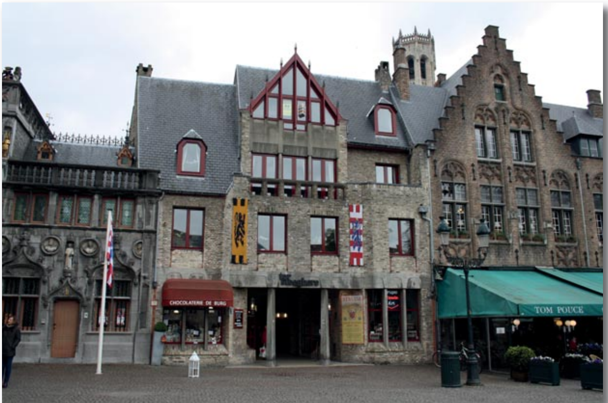
Shopping- and housingproject, Burg 16, 1977

From 1970 onwards the tide is definitely turning in Bruges. The focus is mainly directed towards conservation and restoration of the city's valuable heritage. But at least an equal amount of attention is paid to reconciling sometimes large-scale new urban functions with the city's individuality, character and texture. The international modernism that desecrates other historic cities no longer stands a chance in the historic inner city of Bruges. A 'historically inspired building style' is developed in which historical elements are translated into 'modern' architecture. For Bruges, this means that scale and volume have to correspond to the 'ideal' medieval volume and to the historical construction methods and choice of materials. This approach yields a few interesting results. The exaggerated scale of some of the new constructions is disguised by a fragmentation of volumes, the play of recesses and protrusions or the actual replacement of buildings by seemingly identical, historicising copies on a different scale and completely out of proportion.