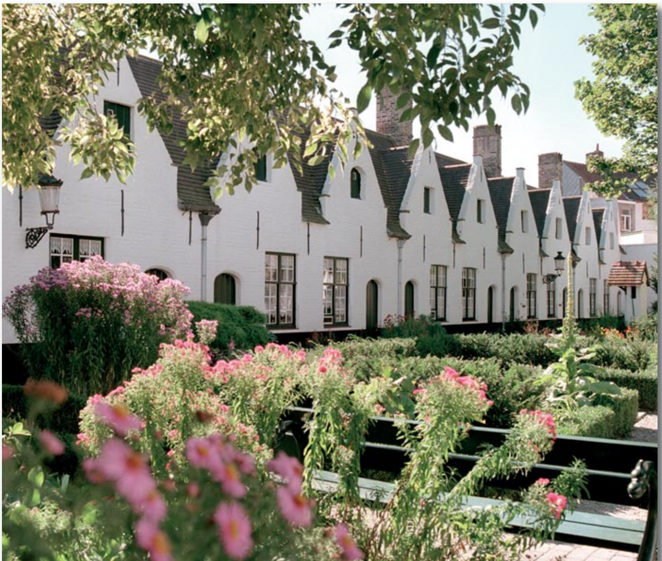
17th-century almshouses Saint Joseph, Nieuwe Gentweg

Finding a balance between the integration of new functions on the one hand and the preservation of the townscape and the city's texture on the other hand, has always proven to be difficult and is still the subject of reflexion and research today.