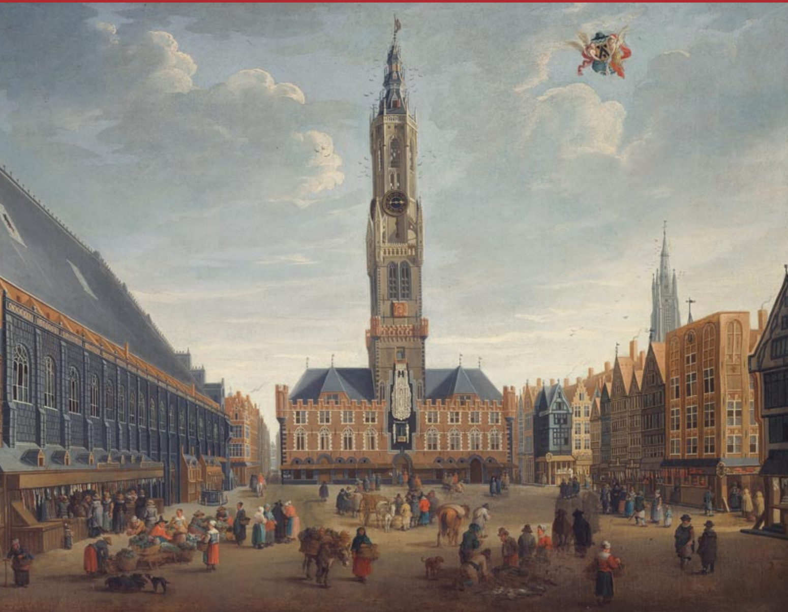
The belfry and the halles, Jan Baptist van Meuninxhove, detail from The Market in Bruges , 1696