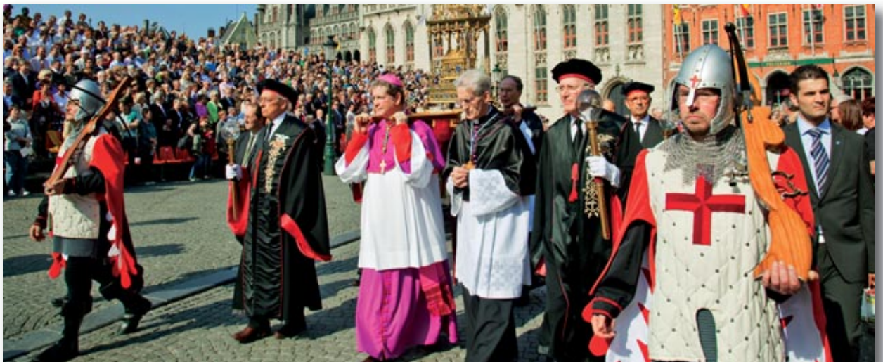
Reliquary of the Holy Blood surrounded by prelates and dignitaries

The Procession of the Holy Blood was added to UNESCO's representative list of immaterial cultural heritage in 2009, partly thanks to the age-old tradition it represents and the local population's connection with it, both in time and in space.