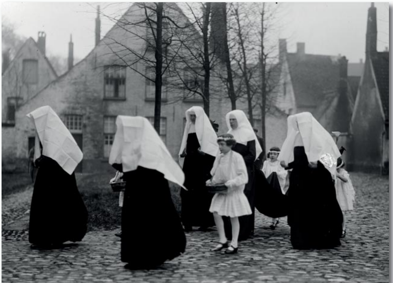
Benedictines in the beguinage, ca 1925

In Flanders, beguinages were usually situated just outside the city walls and were independent entities, both from a social-religious and from an economic point of view. In terms of architecture, beguinages were characterised by a centrally located church, which sometimes also housed an infirmary and which was surrounded by “convents”, individual houses with a front garden, the house of the “Grand Mistress” and the “Holy Ghost Table” for the poor. The beguinage was walled in and accessible through entrance gates that were closed between sunset and sunrise.