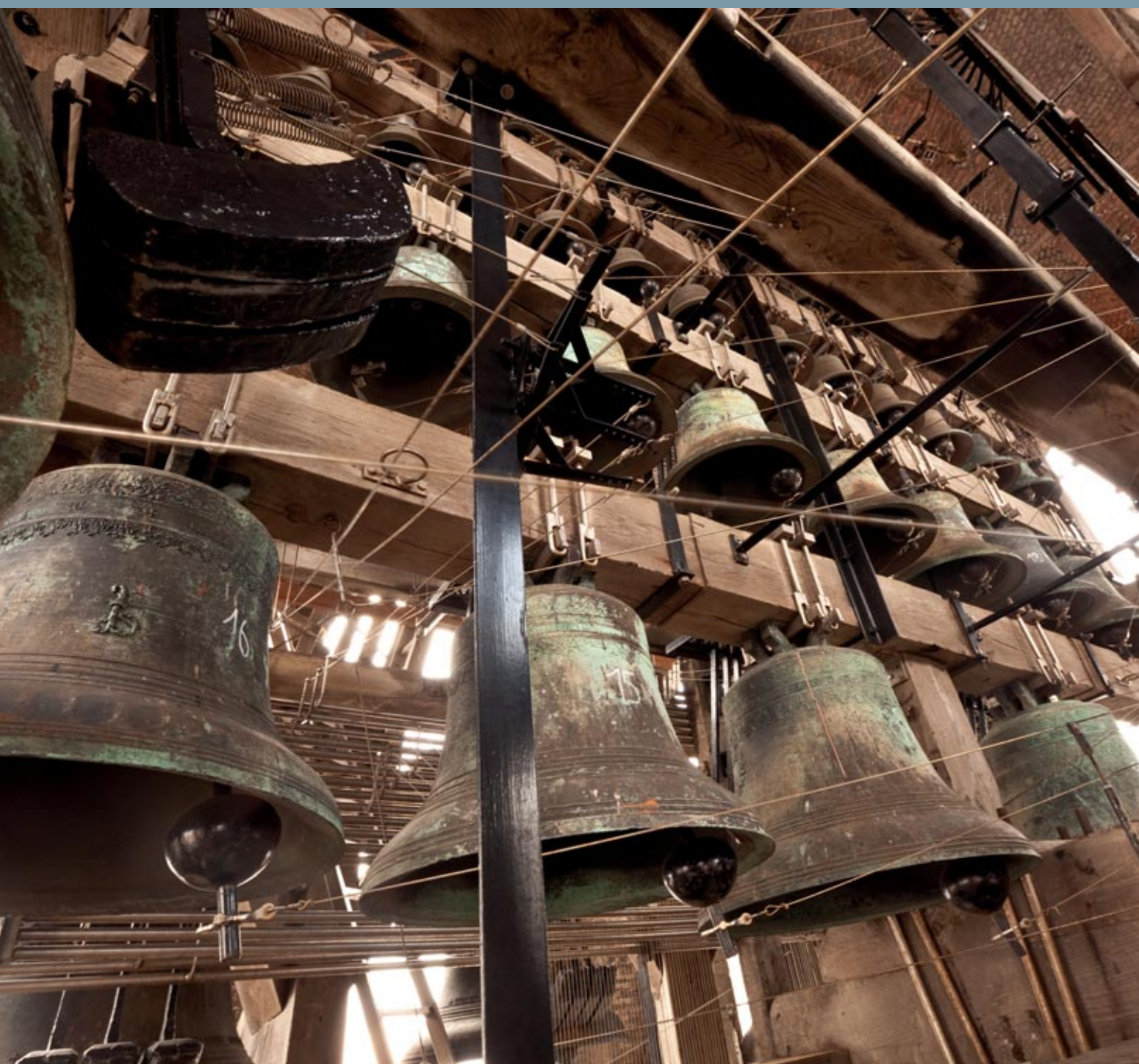
The carillon bells in the belfry, Markt