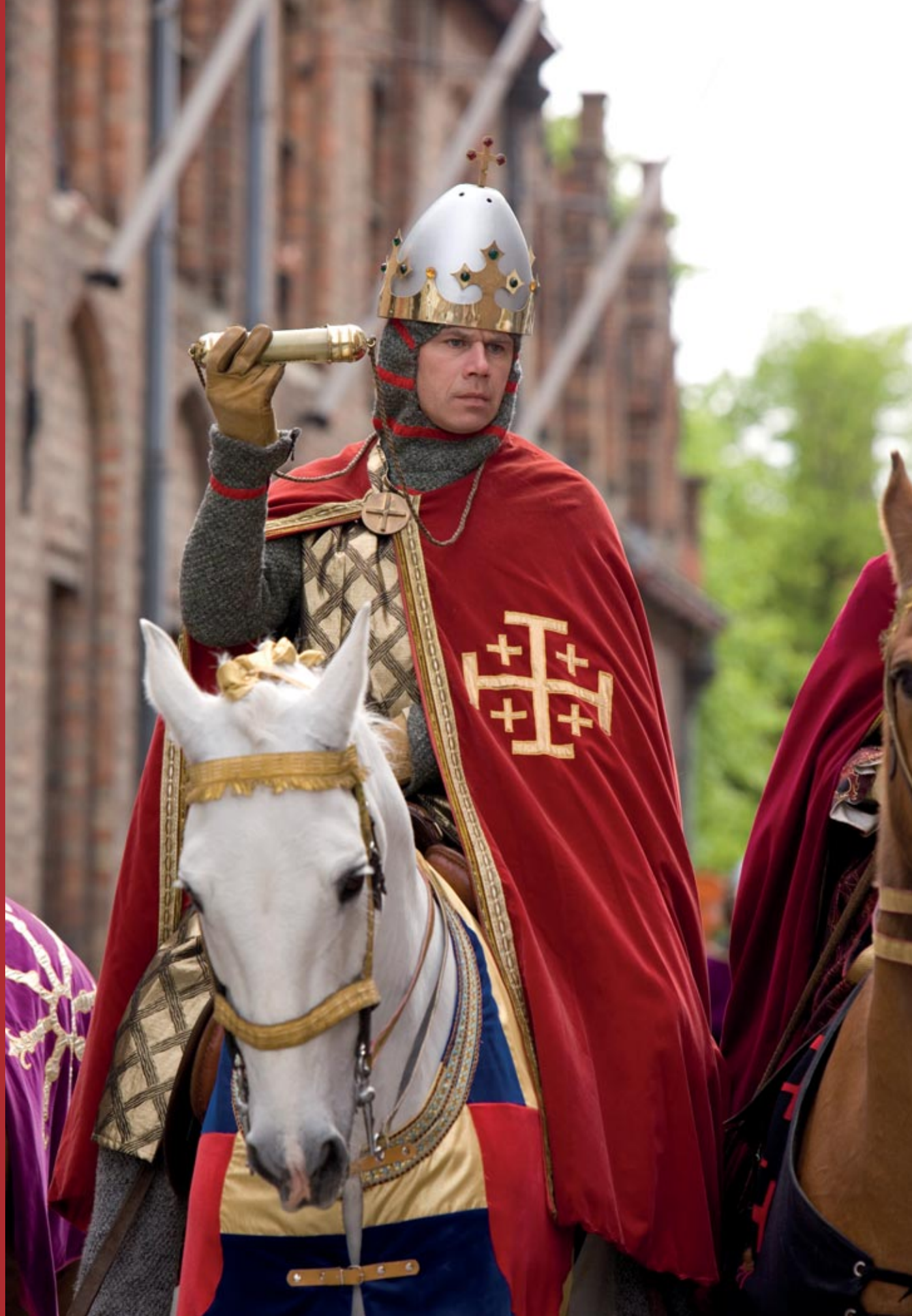
Procession of the Holy Blood