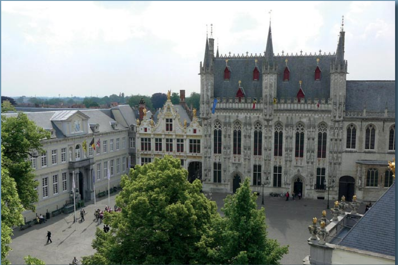
'Burg' with former Court buildings and Town Hall