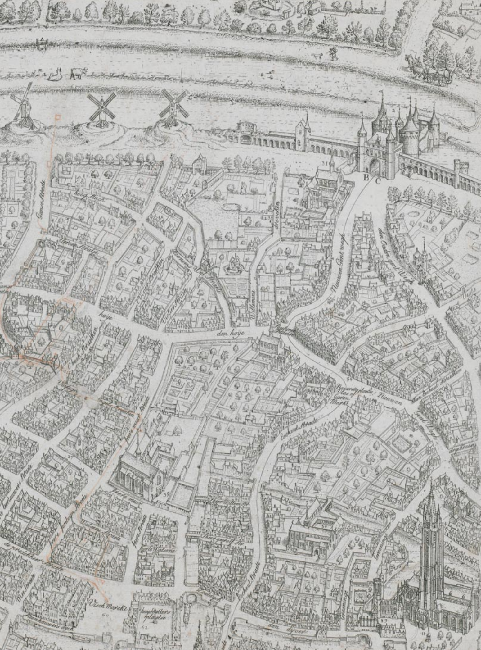
Plan of Bruges, detail, Marcus Gerards, 1562 (Public Library of Bruges)