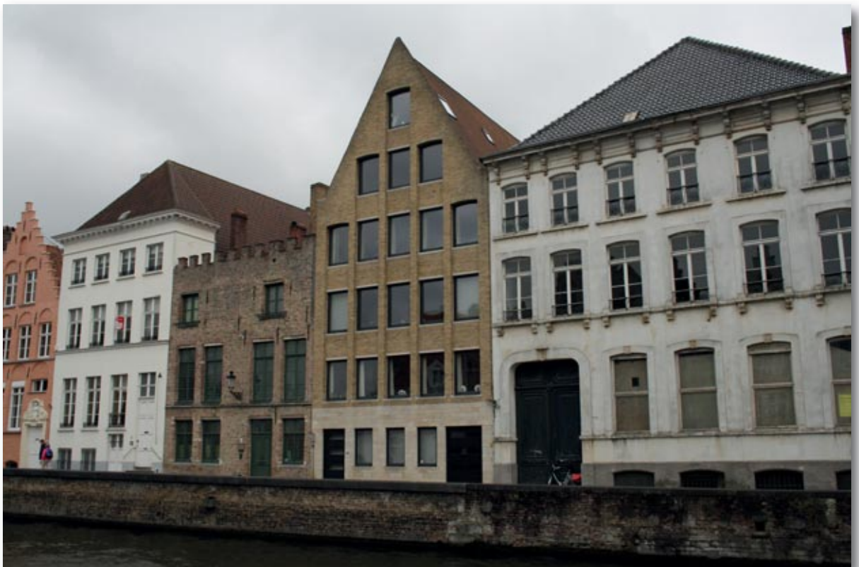
Housingproject, Spinolarei 17, 1965

From the early 1960s onwards the city is on the verge of losing its individuality as a result of a purely economic approach to its heritage. During this period the historical context is completely disregarded and preference is given to modernity (flat roofs, large windows, horizontal segmentation ...). At more visible places in the city, projects are developed that vaguely refer to the city's history, but that are again characterised by exceedingly large volumes and rather meager architecture with façade styles and storey heights deviating from the norm.