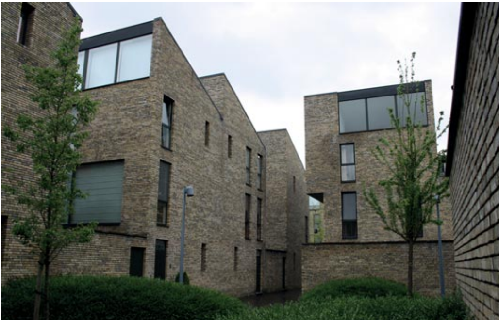
Housing project, Pandreitje, 2003