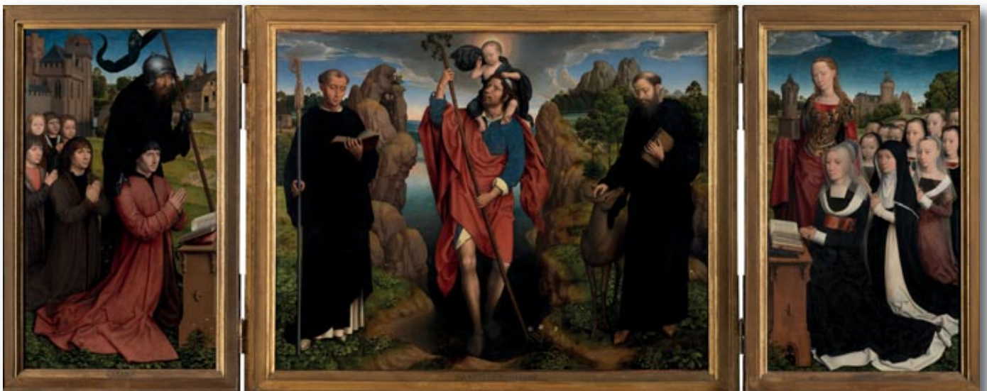
Moreel-triptych, Hans Memling, 1484

Bruges was well-known as a commercial metropolis in the heart of Europe. The last link in the chain of Hanseatic cities, Bruges promoted the propagation of innovating artistic trends, mainly originating from Italy but also from Spain. Still an active, lively city today, it has succeeded in preserving the architectural realisations and the urban structures of the different stages of its development. The stately belfry with the market halls, the beguinage, the medieval hospitals, the churches, the convents and monasteries are regarded as exceptional reflections of the commercial and cultural history of the city and of mankind.