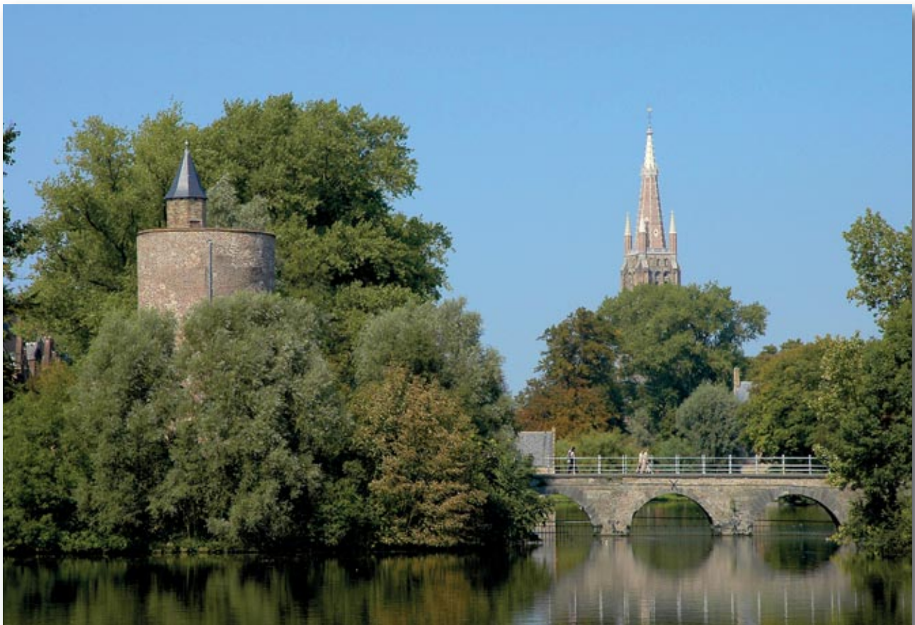
Begijnenvest and the Minnewaterpark

Through this Management Plan, the city intends to continue to assess the policy pursued while providing political and legal support.