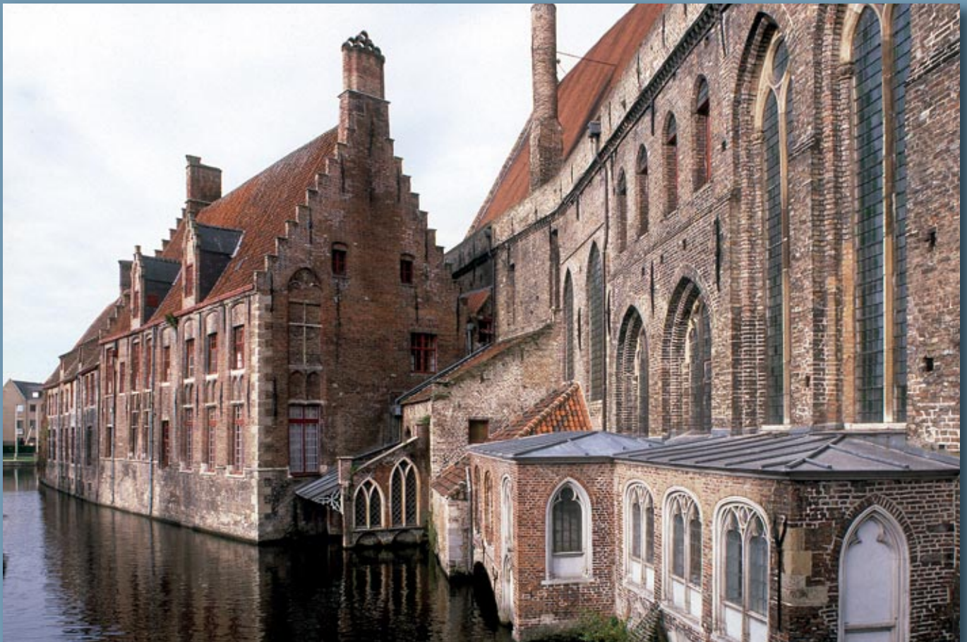
The 'Reie' with the former Saint-John's hospital