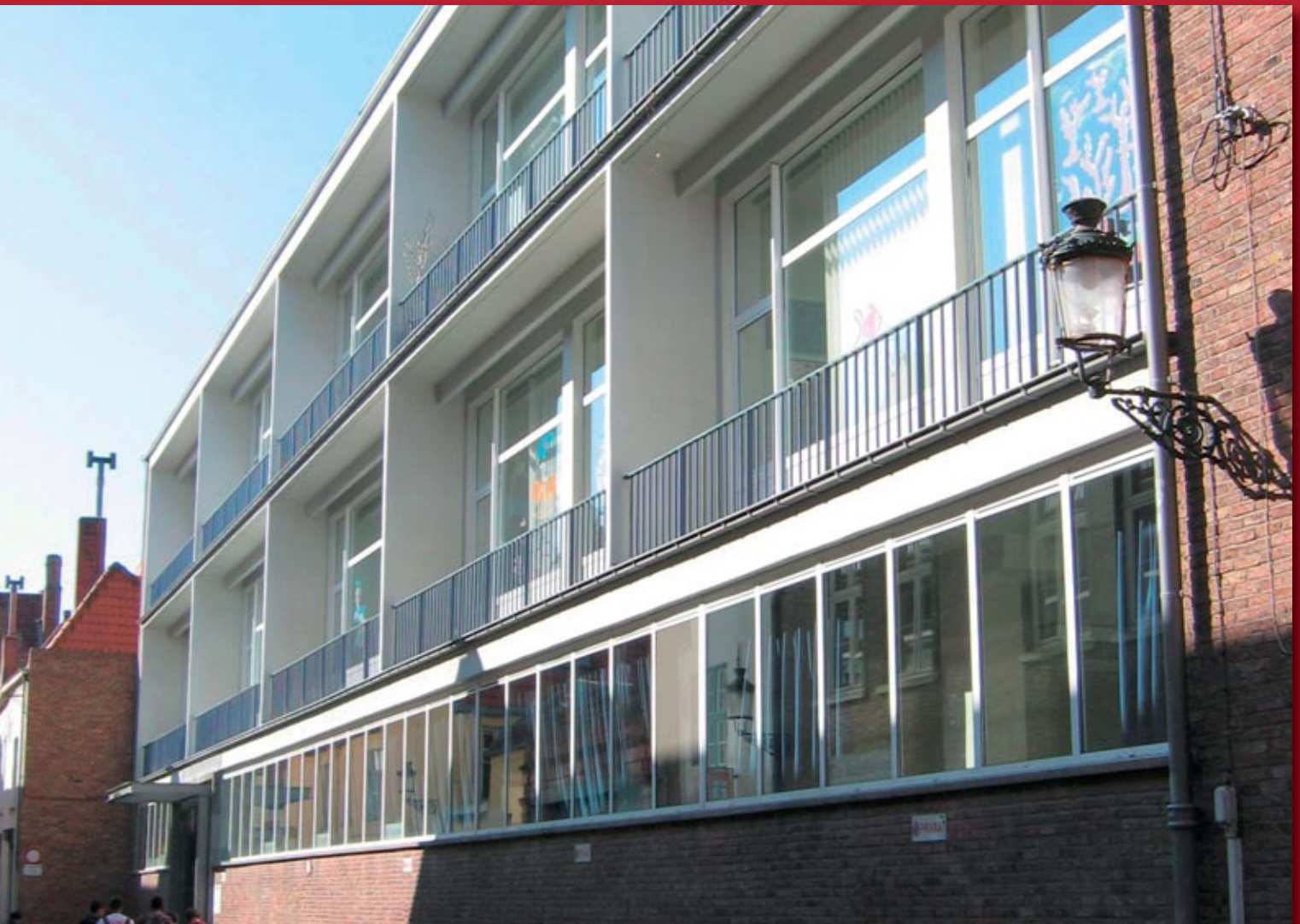
School, Giststraat, 1969