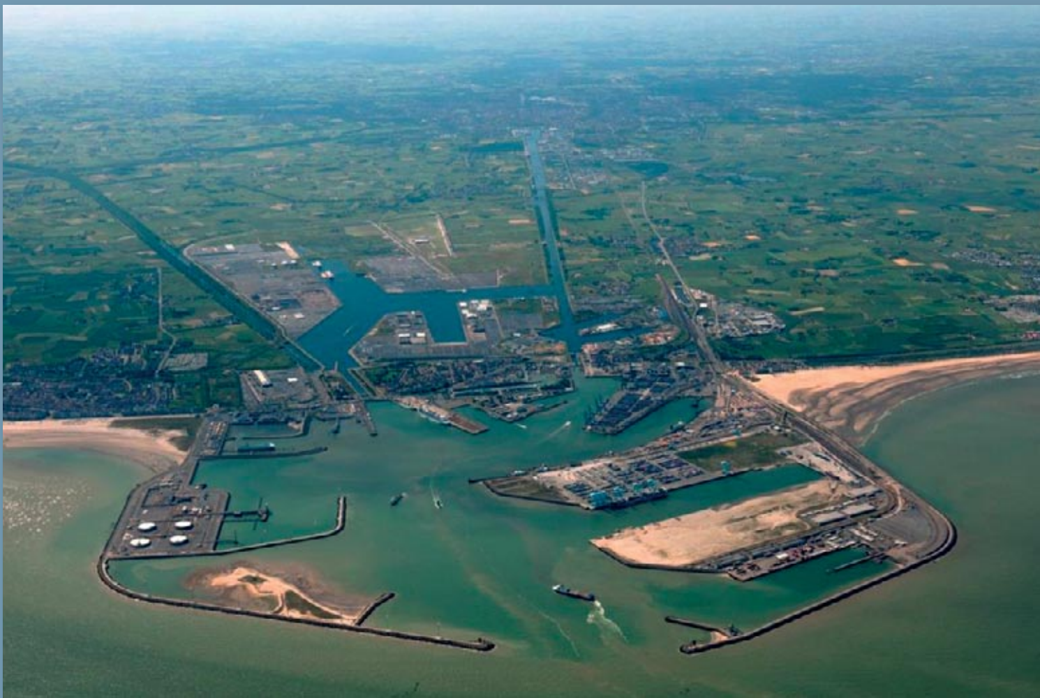
Outer harbour of Zeebrugge