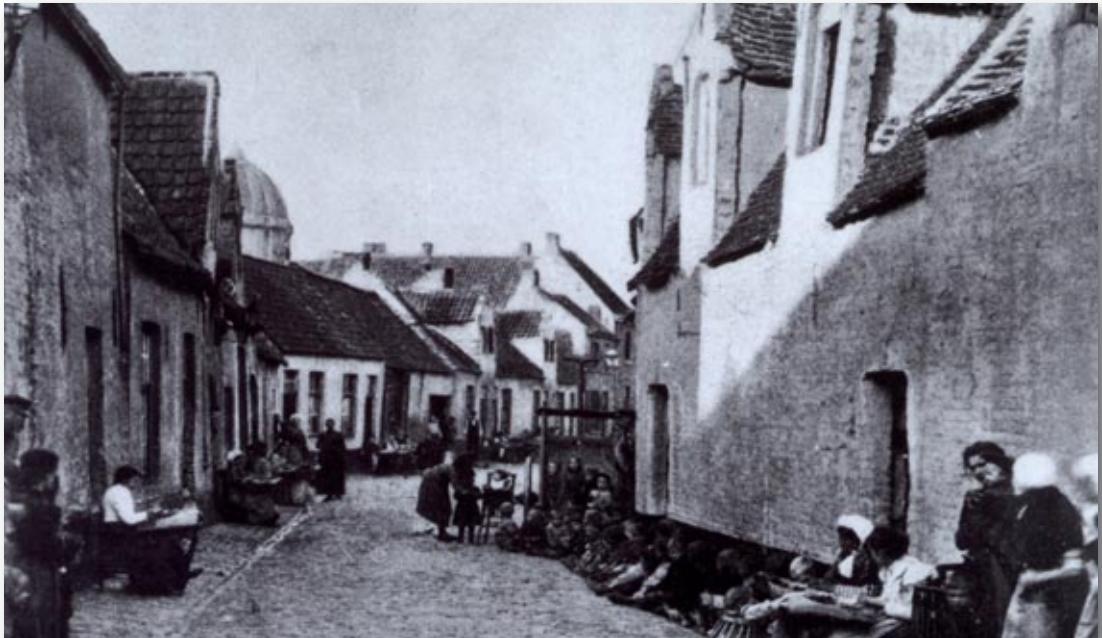
Typical street with working-class houses and lacemakers, Rolweg, 1898

Inside the city walls, a number of noticeable changes to the urban structure were made, especially during the second half of the 18th century. The Coupure canal was dug in 1751-1753, under the Austrian rule, and a number of watercourses no longer in use were vaulted over. As a result, new squares were created and residential buildings were constructed. Trade and inland navigation activities mainly took place in the warehouses near the Handelskom.