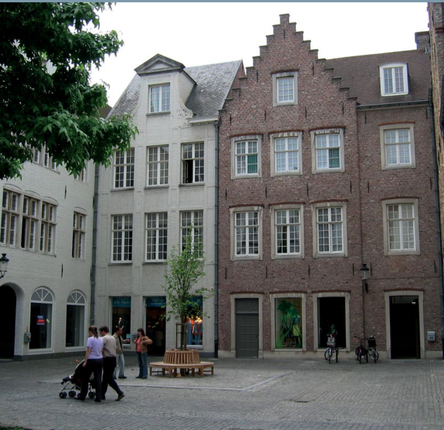
Shopping centre and social housing, Zilverpand, 1976