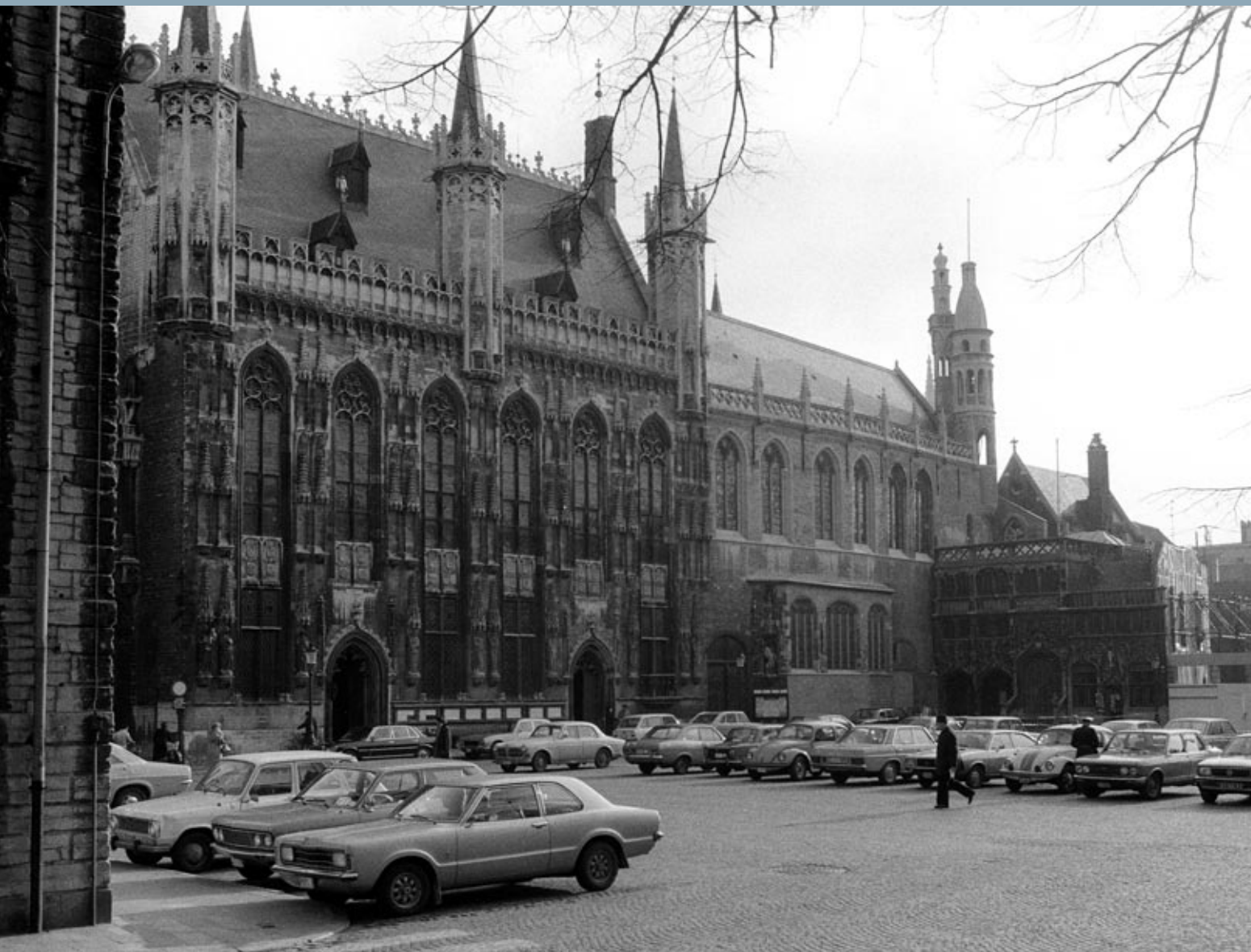
Parking spaces on the Burg, 1970s