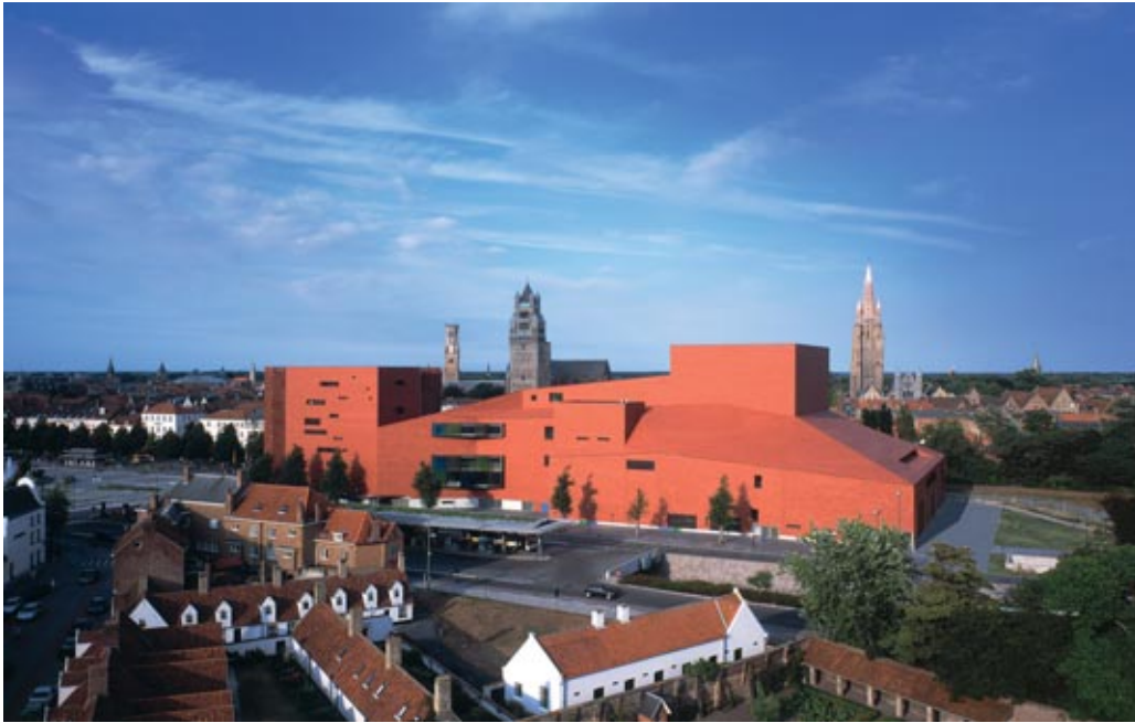
Concert Hall, 't Zand 34, 2002