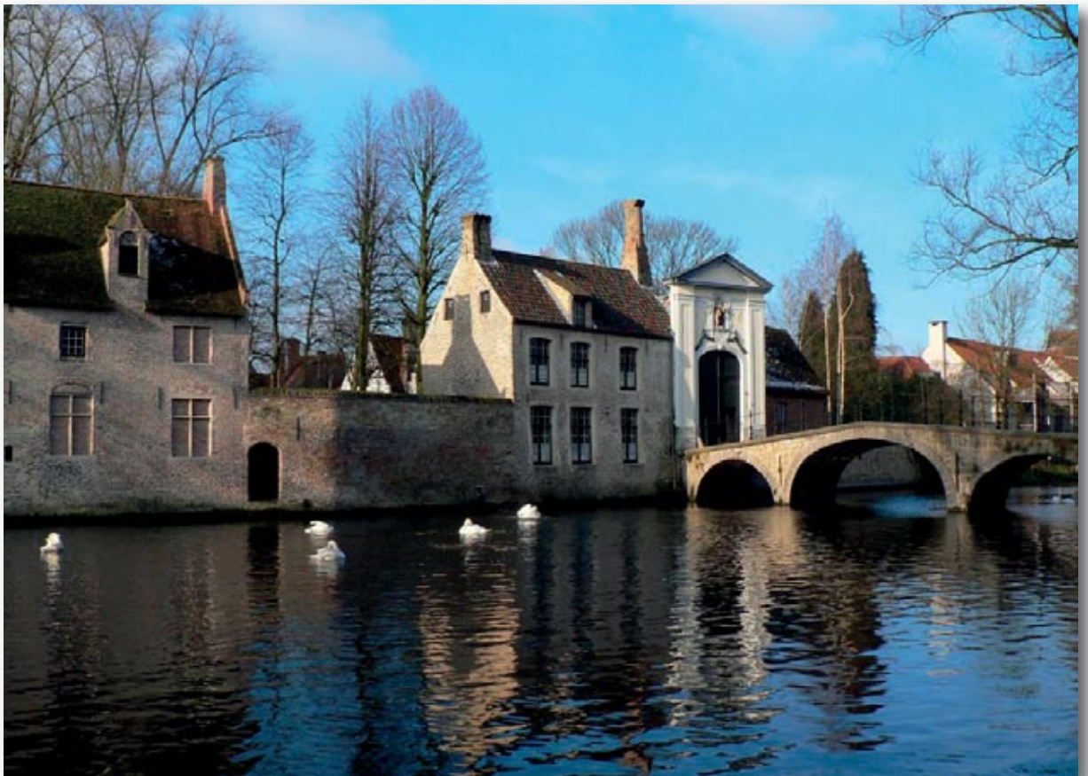
Minnewater and the main entrance of the Beguinage

Together with a representative group of 13 other Flemish beguinages, the beguinage of Bruges was included in the World Heritage List on 2 December 1998 (Kyoto, Japan).