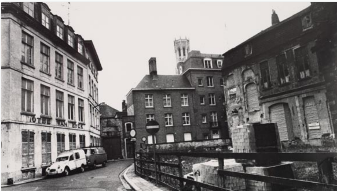
The Zilverstraat in 1975

By the mid-1960s, however, living conditions in the inner city have severely deteriorated and the 19th-century restoration philosophy, so carefully developed, dwindled away. The situation can be described in just a few words: clear competition between the old city and the suburbs, resulting in a loss of many of the old city's functions, a high unemployment rate and a low degree of industrialisation, an impoverished population in the inner city (those who have the financial means construct their houses in the new suburban districts), an average inoccupancy rate of one in eight houses, a large number of dilapidated houses, a lot of demolitions and the lack of a clear municipal view on urban development.